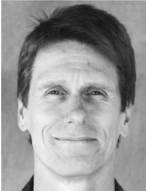
A true gourmand's nose, round and fleshy