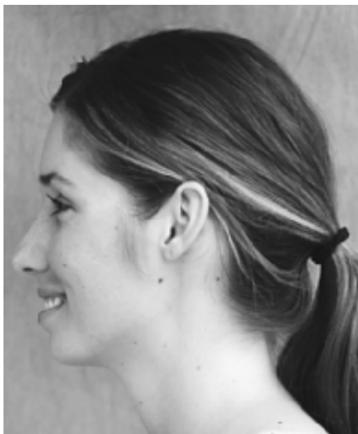
A straight nose

in sensual pursuits, you know your limits. Your many friends depend on you, and you don't let them down.