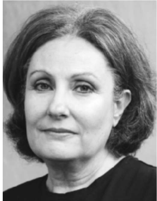
A nose with a split tip

one side than the other) have split feelings about their love of things and food. It might be their guilt that keeps them from completely enjoying themselves. A student once said he was glad that the end of his fleshy nose had a little split in the middle. Otherwise, he was sure he would be very overweight.