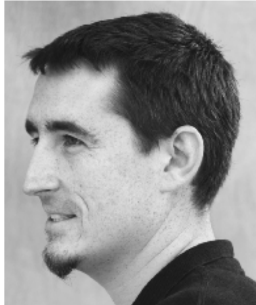
A thin, sharp, and pointed nose

If you have a broad nose , you might be the one to take off on that impromptu intercontinental shopping spree. You love to be on the go and will enthusiastically take advantage of as many opportunities for pleasure as you can. Though you can get lost