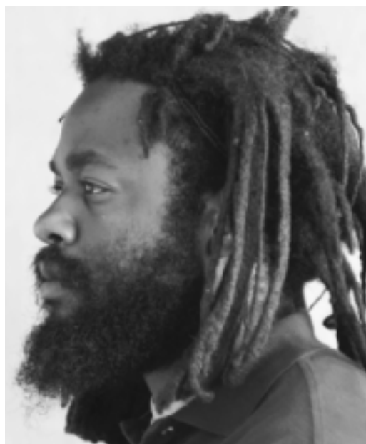
A low-set nose