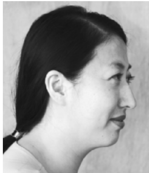
A long nose

Short-nosed people are loyal and compassionate, but generally short on drive and ambition. They just don't have the emotional stamina to thrive in competitive conditions and are often wary and overwhelmed by those who have strong egos and drive. They like the results that the aggressive types get, and this can lead to frustration, even resentment, and a