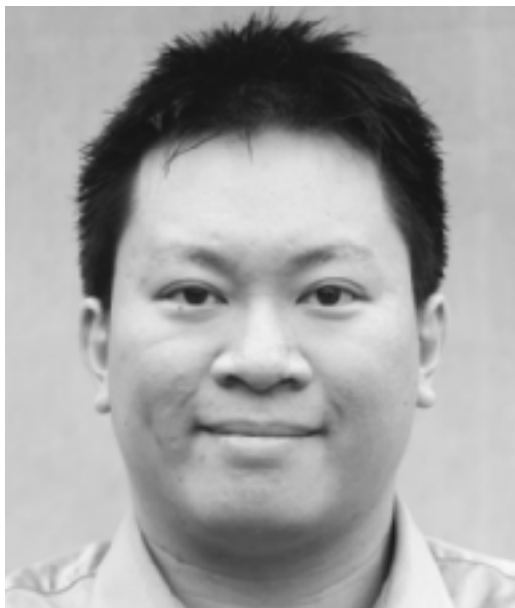
A broad nose