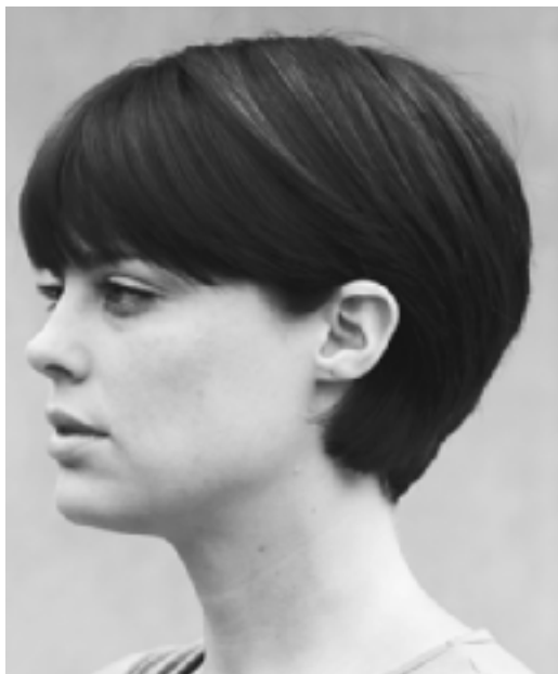
A small nose that fits the face

they can be naïve visionaries, impatient for results. This leads to frustration, which can lead to temper outbursts. Even so, they do think of others and are always willing to help out for the greater good, usually making the task fun. They love to play and have to love what they do in order to work hard.