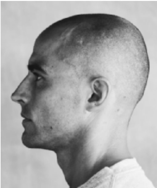
A narrow nose

Be careful not to confuse the narrow outlook and narrow range of interests of the narrow nose person with narrow-mindedness. These people tend to be mega-experts, honing in on the most detailed, esoteric specifics of their chosen interests.