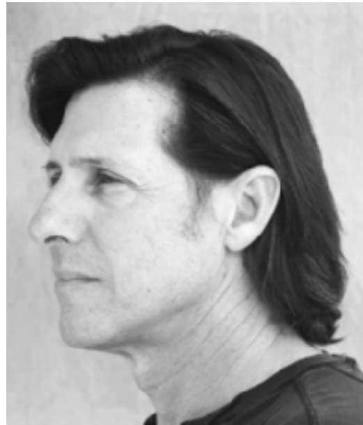
A large nose that fits the face

Many with small noses don't care to be leaders. They are best in group activities where they use their creative imaginations and spontaneity. Their challenge is that